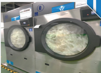
LAUNDRY & DRYING 1