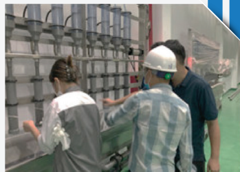
SEMI-FINISHED PRODUCT INSPECTION