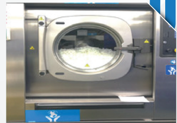
LAUNDRY & DRYING 1